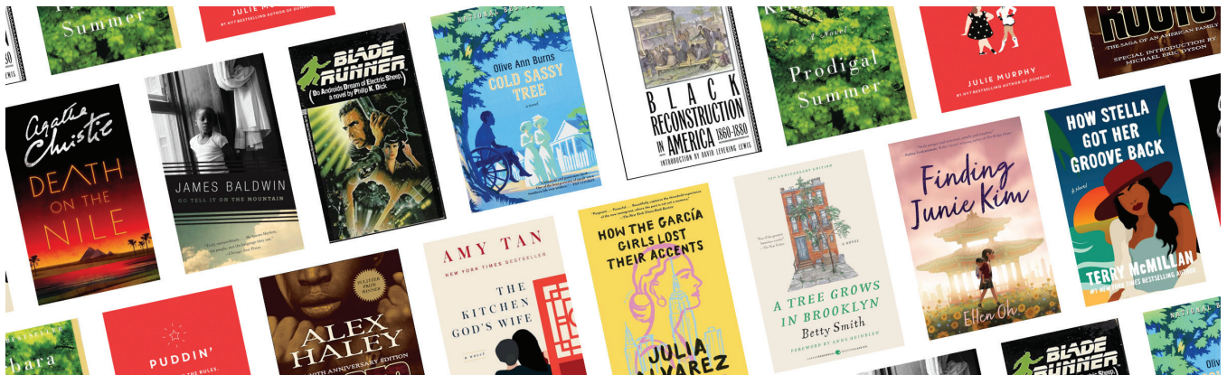
Many titles appeared in PEN America's Index of School Book Bans for the first time during the 2023-2024 school year.

Efforts to suppress students' freedom to read continue to affect swaths of literature. From classics novels and popular fiction to young adult stories and American history, several titles that appear in PEN America's Index of School Book Bans for the first time during the 2023-2024 school year include: