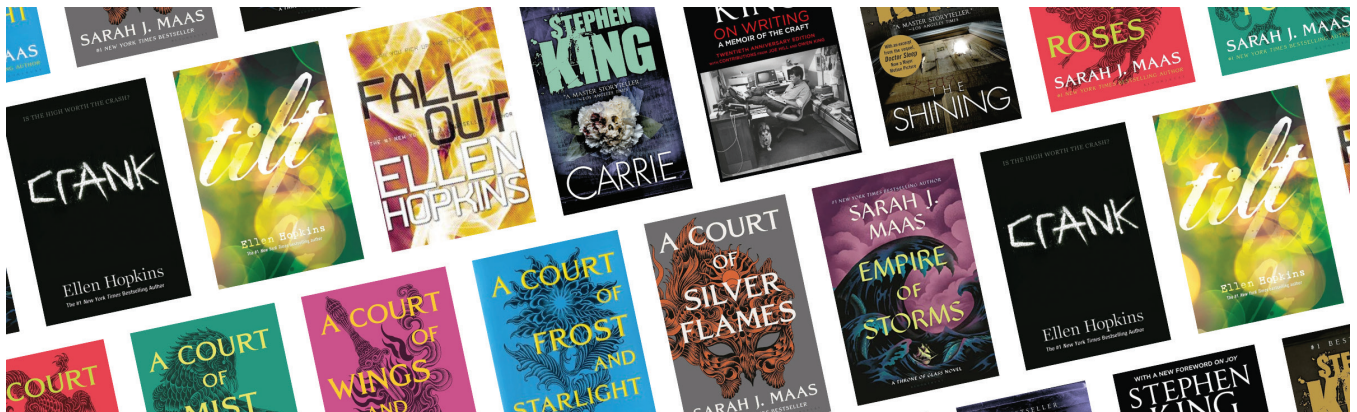
Several authors saw their back catalogs targeted after experiencing their first ban, including Sarah J. Maas, Stephen King, and Ellen Hopkins.

PEN America will release the final count for the 2023-2024 school year, an in-depth analysis of the content of banned titles, and a public Index of School Book Bans later this fall. For more information visit pen.org/book-bans .